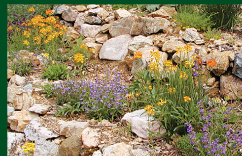
Wallflowers and Blue Mist Penstemons