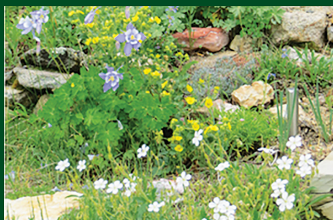
Geranium and Rocky Mountain Columbine