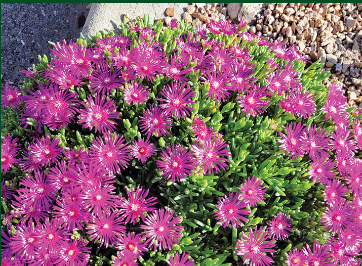
Purple Ice Plant