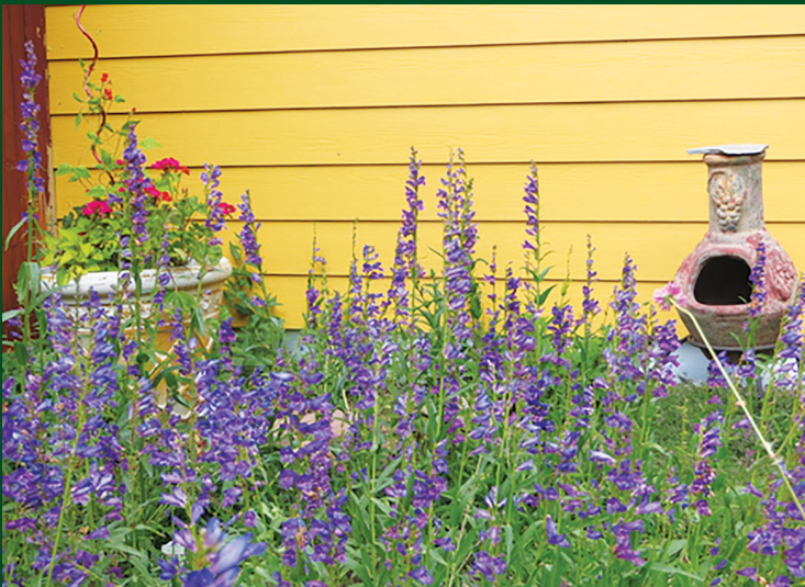
Rocky Mountain Penstemon